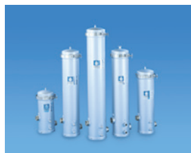
Multi Cartridge Housings