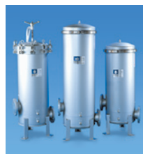
High Flow Multi Cartridge Housings