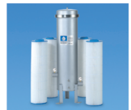
Jumbo Cartridge Housings