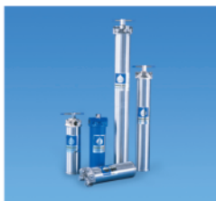
Single Cartridge Housings

Shelco® manufactures a full line of filter housings. From our rugged single element housings to our heavy-duty multi-rounds and bag housings, we have the right filter for your requirement. Shelco® is the perfect choice for your problem solutions.